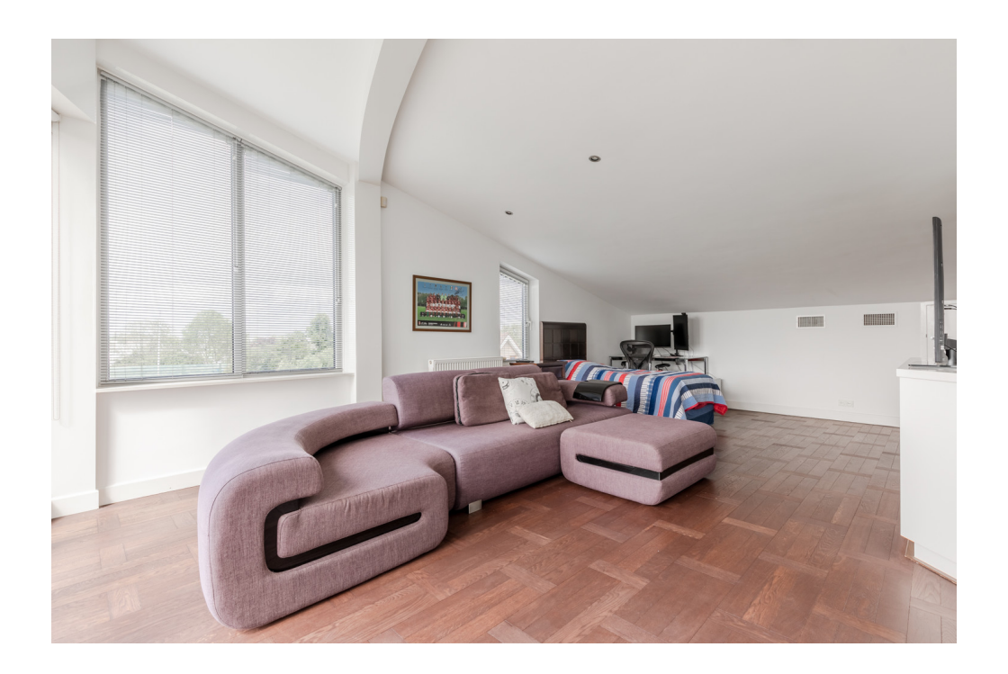
Tolheksbos 10 - Amstelveen Tweede Verdieping