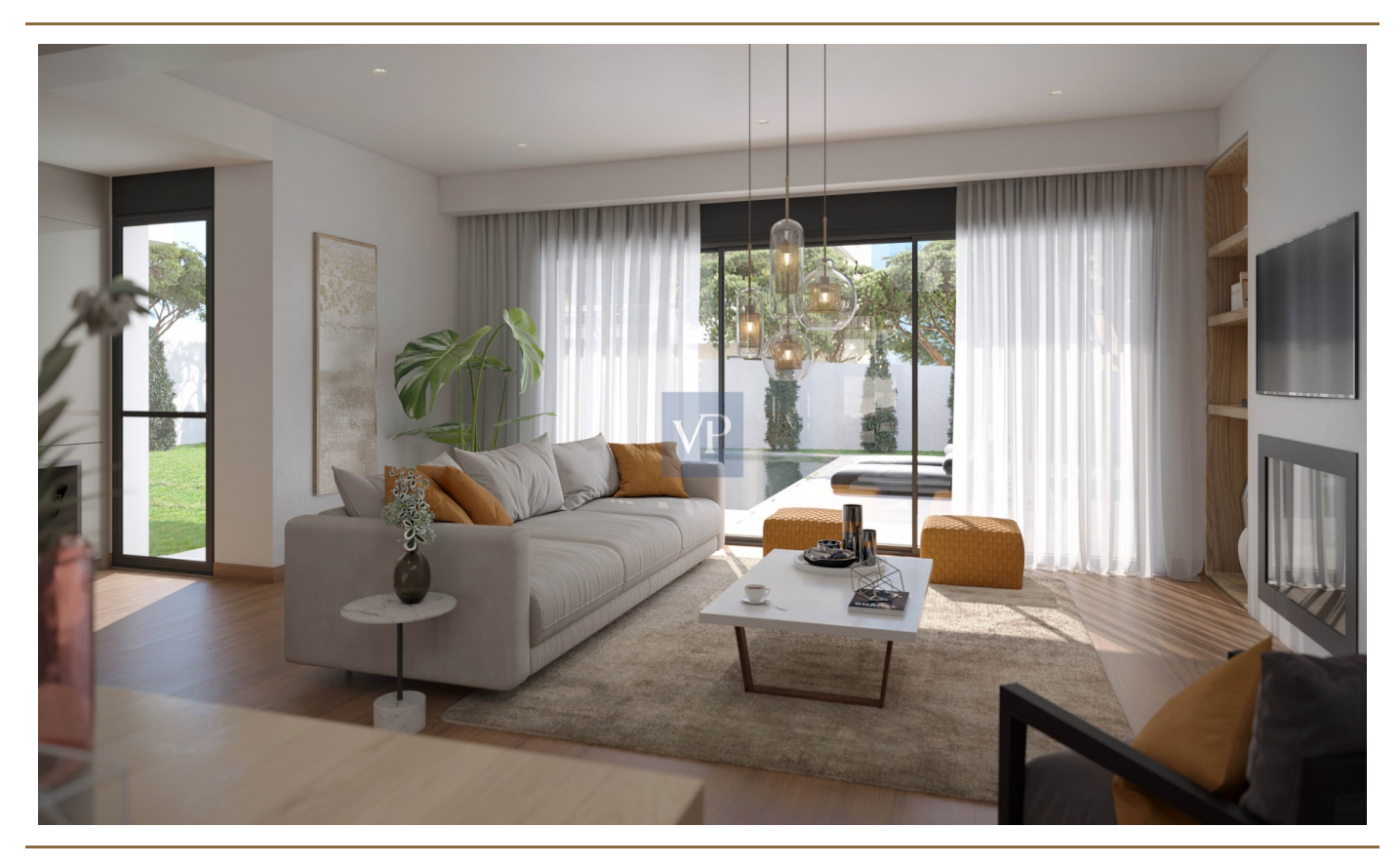
PURCHASE PRICE: 751.000 EUR